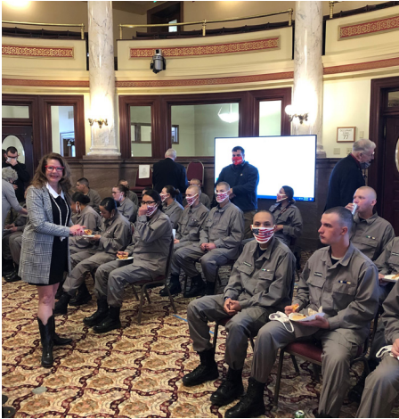
Welcome to the Montana Youth Challenge Class #44 cadets as we celebrate HB 556 - Provide alternative means of earning high school diploma